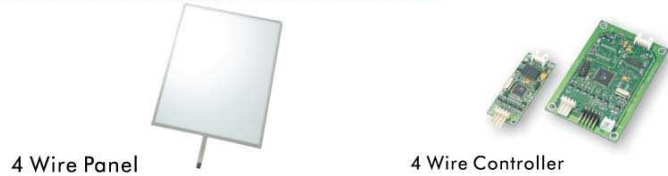
4 Wire Panel