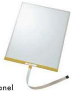
5 Wire Panel